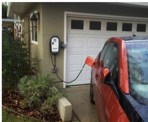
Figure 2: EVSE Installation