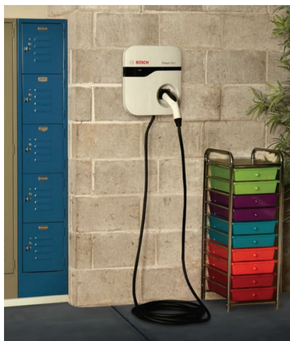
Figure 3: EVSE Installation