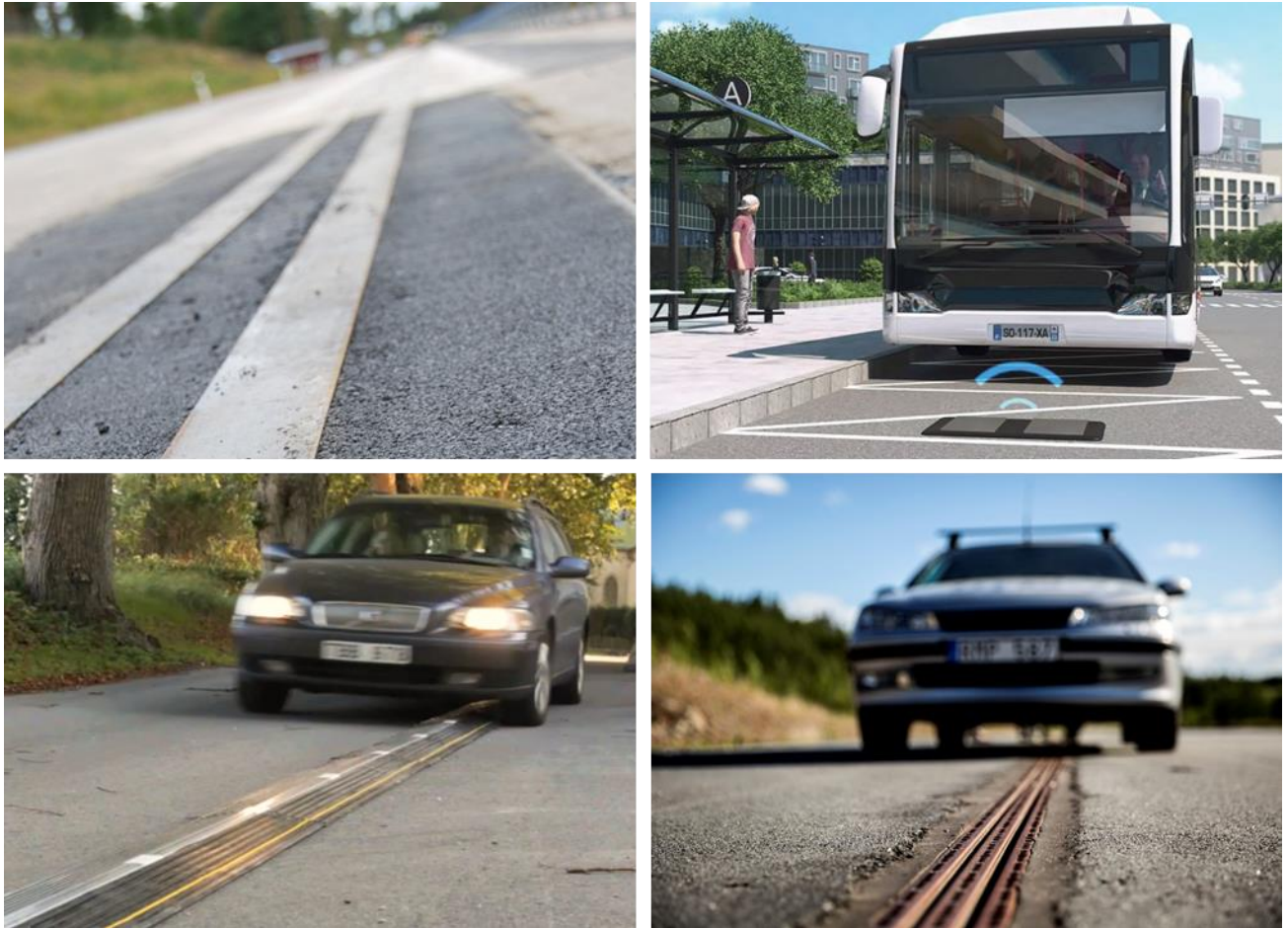
Figure3: The four solutions considered for automatic charging from road to electric cars. Alstom ERS rails are displayed in the picture top left. An artist's idea of Alstom SRS is displayed in the picture top right. The lower left picture shows the Elonroad rail. The picture to the lower right shows the Elways rail.